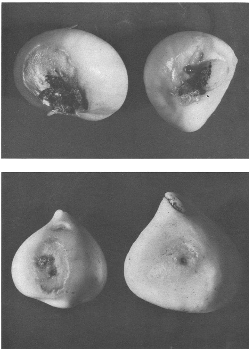
FIG. 1. Fusarium symptoms on tulip bulbs a few weeks after harvesting.

Above: diseased spots emanating from the basal plate.