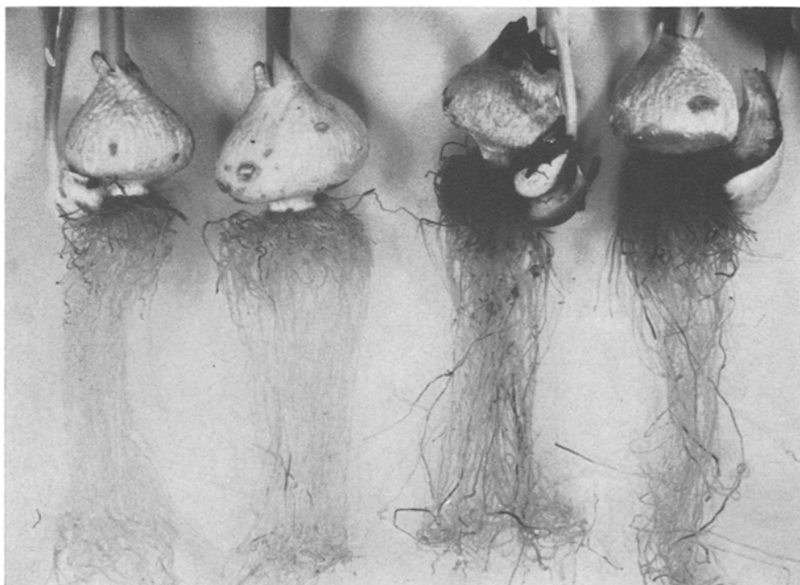
FIG. 3. Roots of tulips grown in glass vessels of Fig. 2, after eight weeks at 10° or 20° C soil temperature.

Tulpen, gekweekt in hyacinte-glazen, waarbij de wortels groeiden in geïnoculeerde grond, waarmee de bol niet in contact kwam.